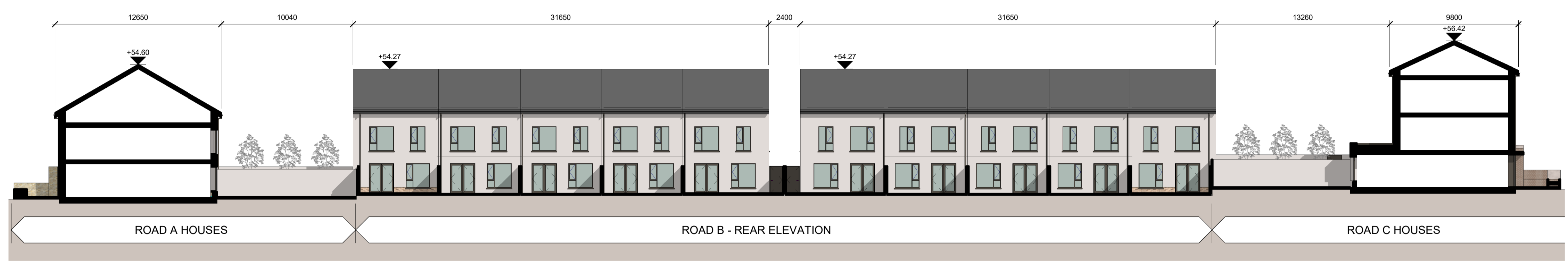
2 ROAD B - REAR ELEVATION 2004 SCALE 1 : 200