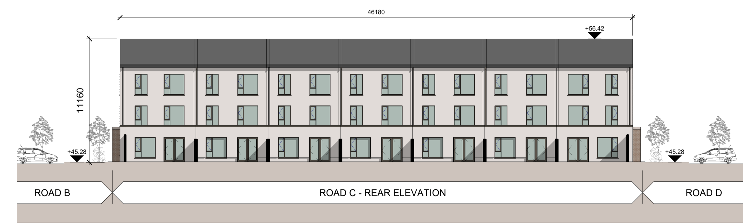
3 ROAD C - REAR ELEVATION 2004 SCALE 1 : 200