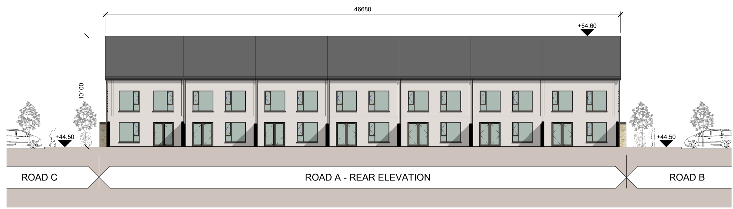
1 ROAD A - REAR ELEVATION 2004 SCALE 1 : 200

ALL DIMENSIONS TO BE CHECKED ON SITE NO DIMENSIONS TO BE SCALED FROM THIS DRAWING DRAWING IS TO BE READ IN CONJUNCTION WITH RELEVANT CONSULTANTS DRAWINGS